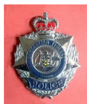
National Police Certificate