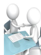
USC Student Placement Agreement

All of the mandatory requirements above will need to be fulfilled and uploaded to your SONIA (WILS Online) account prior to the commencement of your placement. PLEASE NOTE: You will only be granted access to WILS Online, once you have accepted your offer and have been enrolled into your program.