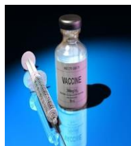
Vaccination Preventable Diseases [VPD]